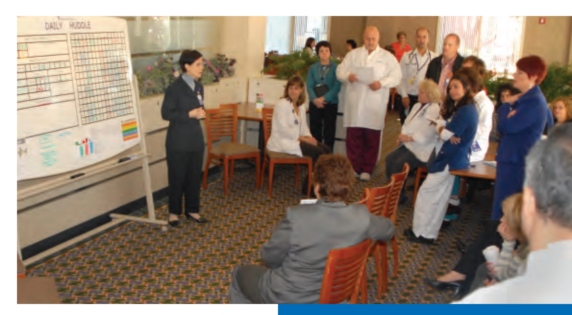
Bitsoli leads a daily huddle.

Reward and recognition was another important piece of the process. Employees who are mentioned positively on a survey are entered into a monthly drawing for a $50 gift certificate. They also get a "You're a Star" card for a free lunch in the cafeteria. "We've found that praise is very important and very rewarding to the department."